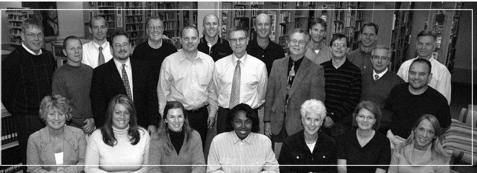
The Timothy Board of Directors 2007-2008