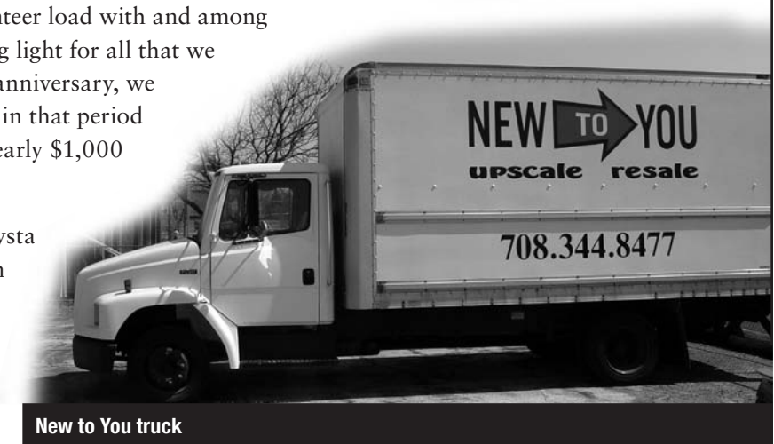
New to You truck