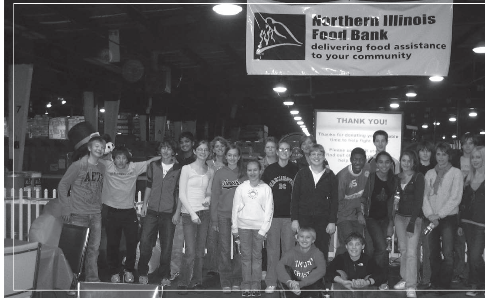
The 8th grade food depository crew

Absentee Ballots must be put into an envelope with signature on the outside. Bring to the Society meeting or to a school office by Monday, May 26.